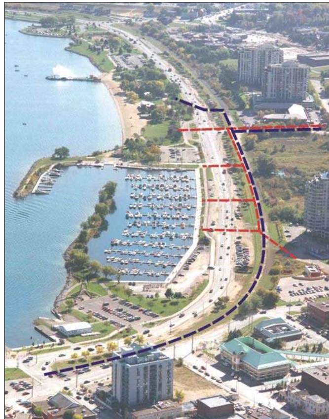
Barrie's waterfront showing Lakeshore Blvd, the abandoned railway right-of-way and the location of the project. The purple dashed line indicates the transmission main and the red dashed line shows the transmission main location.

This was the first major project undertaken by the City of Barrie using trenchless technology. It not only resulted in a considerable saving when compared to conventional open-cut methods, it also minimized the disruption normally associated with the installation of buried services. The project, awarded to Rexco Limited of Gadshill, Ontario, at its tendered price of $1,400,000, was completed with little disruption to the public, on time and on budget.