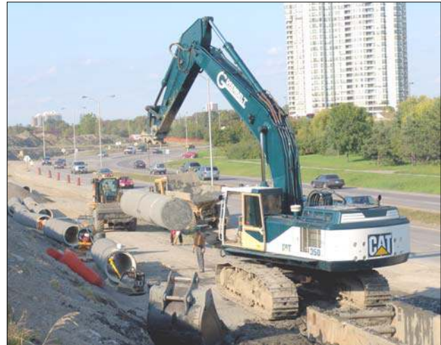
By installing the new trunk water main off the traveled portions of the four-lane divided roadway (Riverside Drive), traffic disruption was kept to a minimum.