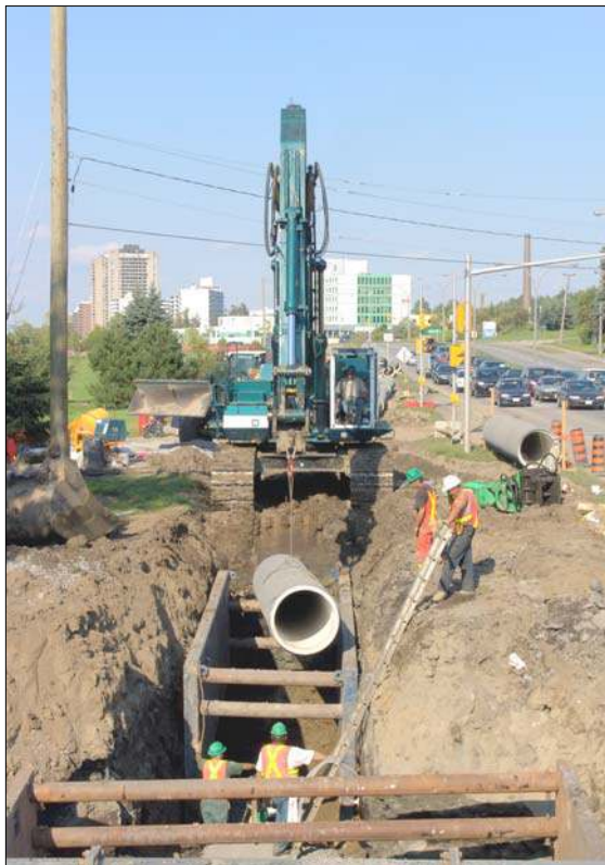
A section of the prestressed concrete cylinder pipe being lowered into the trench.

Prestressed Concrete Cylinder Pipe, the type of pipe specified by the successful bidder, was selected for the water main installation. This material was chosen because of its resistance to hydrocarbon permeation, overall strength, durability, expected life and associated manufacturing cost.