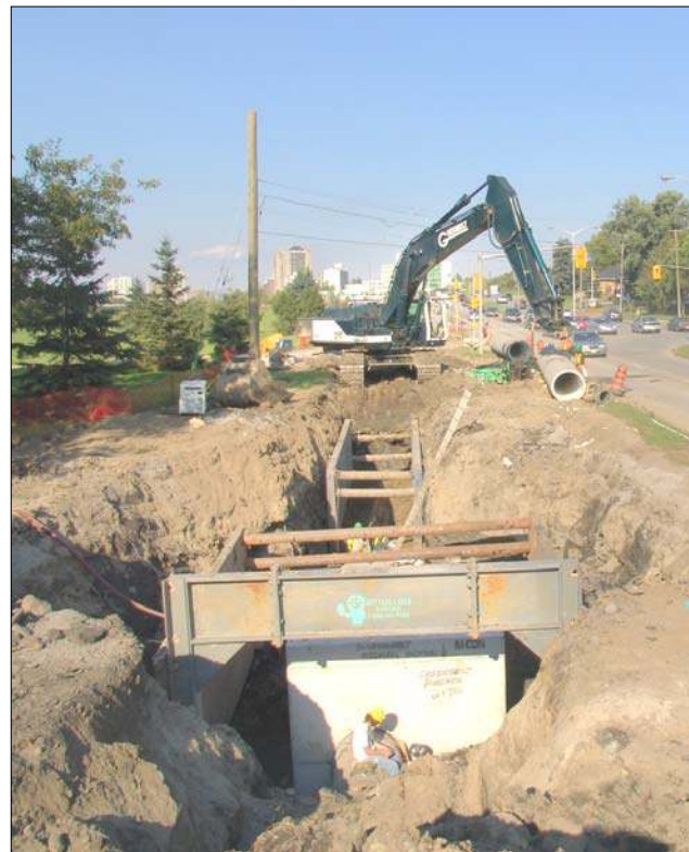
The majority of the 3.9 kms of water main is being installed using traditional trenching methods.