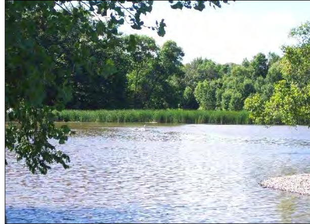
Rattray Marsh is classified as a Type 1 fishery habitat requiring a high level of protection.

Rattray Marsh is classified as a Type 1 fishery habitat requiring a high level of protection, and Sheridan Creek is classified as a Type 2 fishery habitat requiring a moderate level of protection. A total of 21 fish species are recorded for the Rattray Marsh including the Redside Dace, which is considered a threatened species by the provincial Committee on the Status of Species at Risk in Ontario (COSSARO) and a species of special concern by the national Committee on the Status of Endangered Wildlife in Canada (COSEWIC).