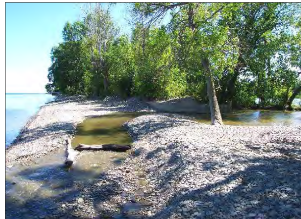
One of the outlets from Rattray Marsh into Lake Ontario.