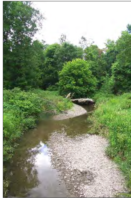
Sheridan Creek – the main source of flow into the marsh.