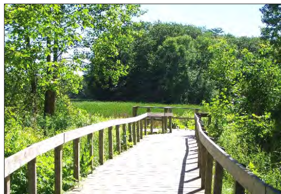
The marsh and associated parklands are used extensively by local residents and visitors throughout the summer. This usage prompted the recommendation of constructing the overall works in stages.

Staging will allow the Region to divert most of the wastewater away from the lakeshore as soon as possible and will greatly reduce the volume of flow that needs to be bypassed when constructing the shoreline sewers under Stage 2.