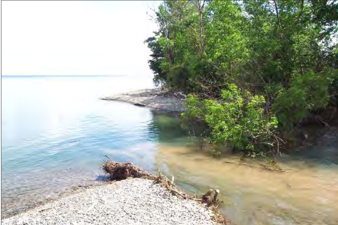
The Rattray Marsh area, shown here exiting into Lake Ontario, has been designated as an 'Environmentally Significant Area' and Provincial Area of Natural and Scientific Interest - Life Science by the Province of Ontario.

The completed Environmental Study Report, outlining the study process, alternatives and the selected preferred design, was delivered to the Region of Peel in July, 2006. The estimated capital cost of the proposed works is $18,500,000. A Notice of Study Completion was issued on April 12, 2006 and the 30 day public review period ended May 12, 2006.