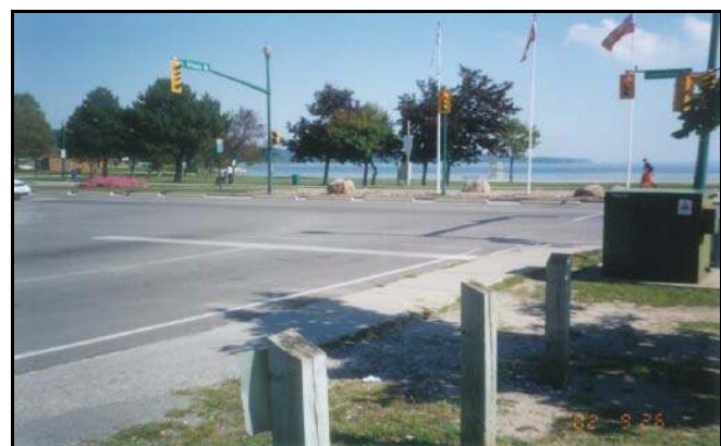
Waterfront Park at Lakeshore Drive.