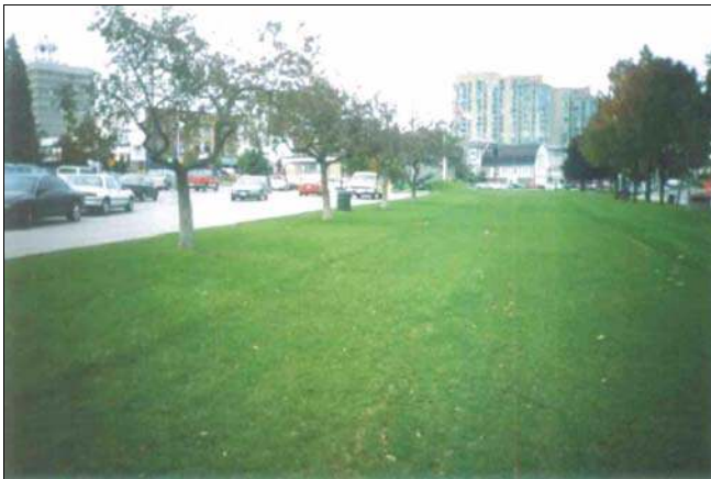
Abandoned railroad right-of-way adjacent to Lakeshore Drive.

In early 2002, the City of Barrie (Ontario) in co-operation with the Ontario Ministry of the Environment (MOE), determined that, under certain conditions, the water output (106 Lps) from Heritage Well No. 14 had insufficient chlorine contact time. To rectify the problem, the City concluded that a new 1040-metre transmission main to provide the required chlorine contact time was required, along with a 622-metre distribution watermain, complete with 6 new fire hydrants. The MOE required that the new transmission main be in service by December 31, 2002.