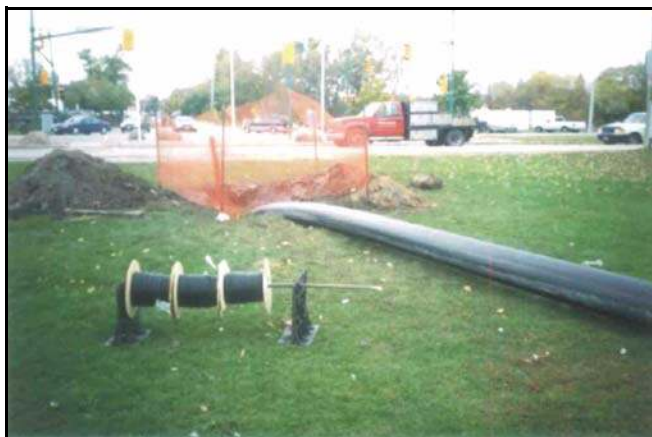
Hydrant lead beneath Lakeshore Drive.

The above helped to familiarize City staff with the benefits (and limitations) of HDD. The project was tendered in September 2002 with HDD as the primary construction method and conventional open-cut as an acceptable alternative in certain identified areas of suitable soils.