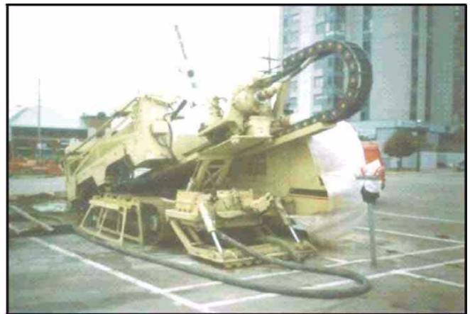
Drilling beneath Bayfield Street.

The project was awarded to Rexco Limited of Gadshill, Ontario, in mid-September 2002, at a tendered price of $1,400,000. Construction was uneventful (problem-free) and was completed on time and on budget with little disruption to the public. Archeological investigations will be undertaken within the near future to determine the origin of the corduroy road.