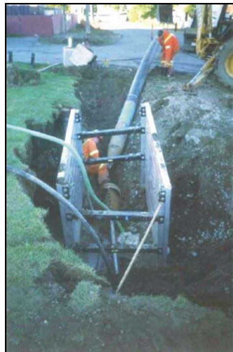
Insertion pit at Toronto Street.