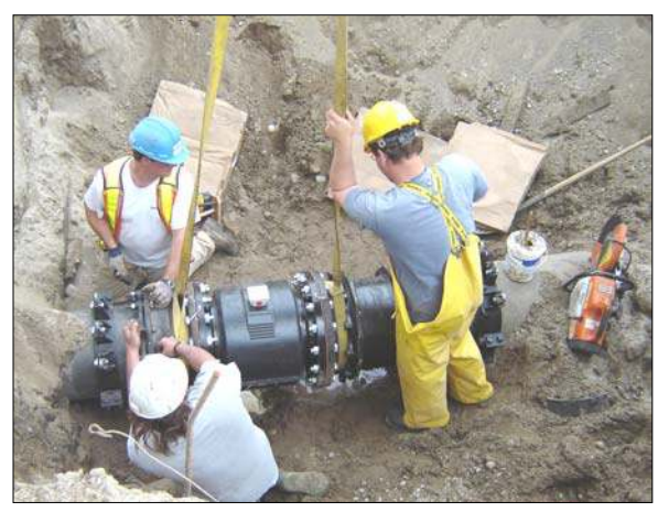
The electromagnetic flow meter being installed on the common fill/draw line.