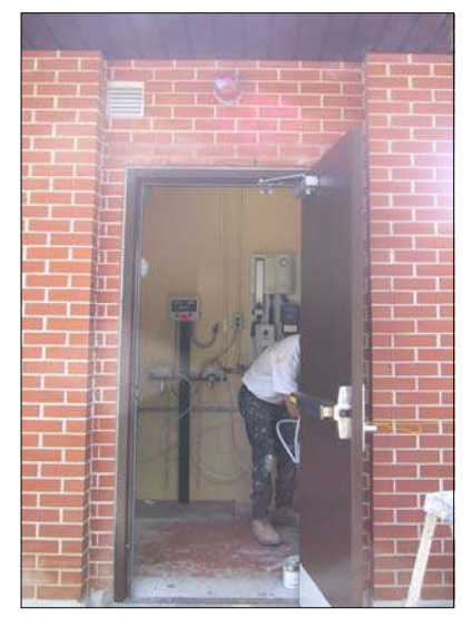
The dedicated access door to the chlorine room. The emergency strobe light and exhaust vent can be seen above the door frame.