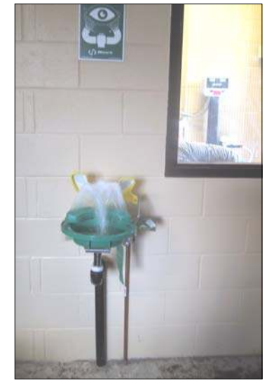
The emergency eye-wash station on the outside wall of the chlorine room.