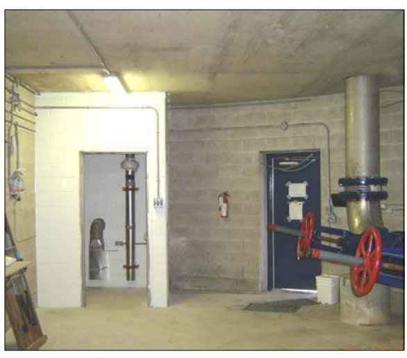
Completed chlorine room inside the valve room at the Mapleview Elevated Tank Reservoir.

determined from analysis of the flow and/or reservoir level data supplied by the City. Although a maximum flow rate of 434 L/s occurred in the system at the Mapleview reservoir; it was important not to set the design maximum at too high a volume, as the chlorinators would be oversized for normal flows. By plotting the highest flow rate and taking the average of the high flows in Litres/second a design rate of 250 L/s was selected.