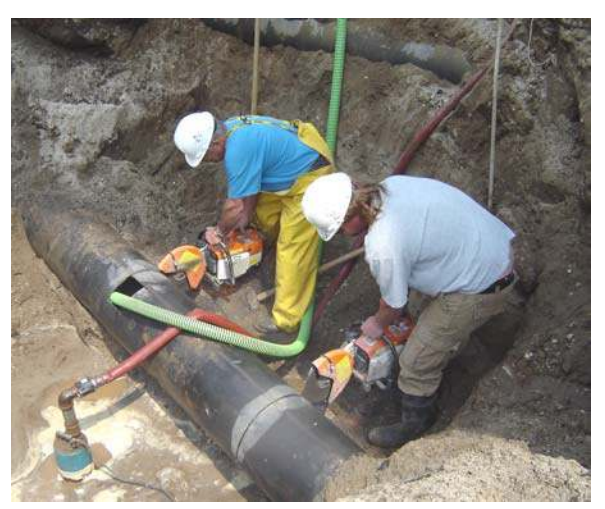
Construction personnel cutting a section of the common fill/draw line to provide a space for the flow meter at the Mapleview Elevated Tank.

Ontario Regulation 170/03 outlines requirements regarding the sampling, reporting, the minimum level of treatment for surface and groundwater supplies and the maintenance of a chlorine residual within the distribution systems. In compliance with the regulation, the work at the City's reservoirs is being implemented to ensure the chlorine residual levels that are currently meeting the minimum requirements are maintained.