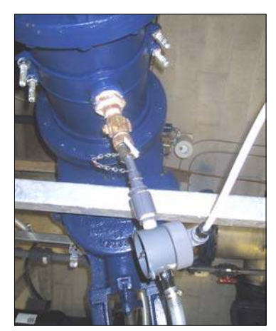
The injector and injection point installation at the Mapleview reservoir.

A 19-mm fixed-throat chlorine injector with an initial rechlorination capacity of 4.5 kg/day (10 lbs/day) was selected; since this size covers the majority of the operating volumes. It was recommended that the injector be provided with sufficient capacity to draw up to 9 kg/day (20 lbs/day) in the event that higher rechlorination rates are needed in the future. The injector is a close-coupled stop style, adjacent to the point of application, which keeps the length of the chlorinated water injection pipe to a minimum.