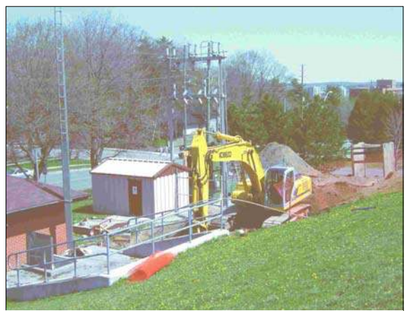
Construction at the Anne Street reservoir.

The City's existing SCADA system was expanded to include the alarms for the Anne Street reservoir's chlorination room using equipment consistent and compatible with the existing system.