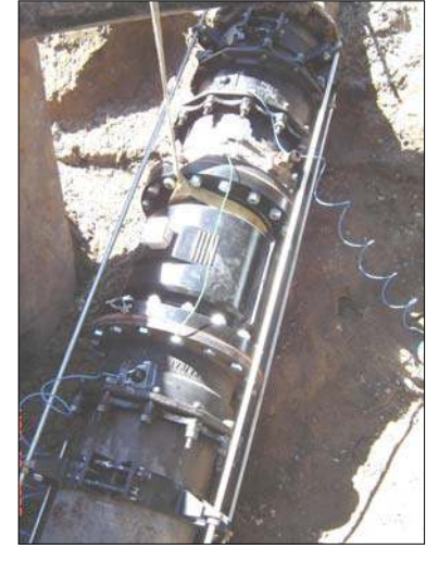
Electromagnetic flow meter positioned on the common fill/draw line.

Zone 2N – retain existing venture flow meter and the existing flow signal.