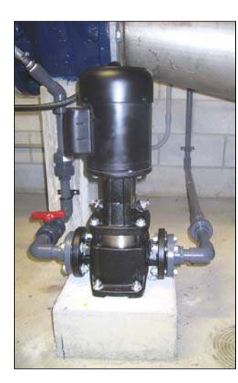
The chlorine booster pump at the Bayfield reservoir showing the water draw and injector piping.