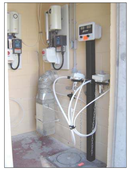
Inside the chlorine room at the Anne Street reservoir showing the chlorinators, weigh scales, vent and gas sensors.

The room, sized to accommodate the chlorination components, gas sensor and HVAC equipment, also has a viewing window from the pump room, a convection style wall heater with thermostat, passive ventilation through a brick vent ducted to the floor and a manually activated emergency exhaust fan. The emergency eye-wash station is mounted on the outside wall of the chlorine room. Construction involved standard non-bearing block walls extending to the ceiling, which were then filled with compressible material to seal the rooms. Existing masonry brick and block was cut for the installation of permanent lintels for the exterior door and all vents and exhaust fans.