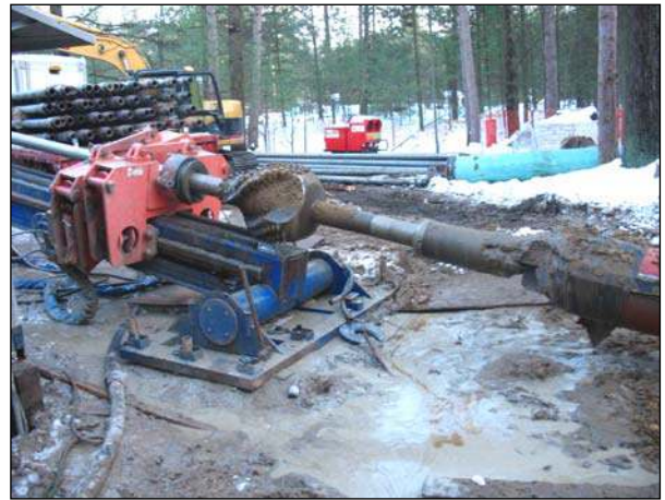
Directional drill equipment.

The majority of construction was completed during the winter months. The weather provided some adverse conditions for the directional drilling crews and the installation of the pipeline. The project was completed within budget constraints with substantial completion being achieved in January 2009.