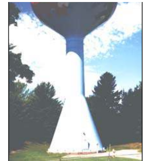
East End Reservoir

Option 2: Construction of New Watermain along Powerline Road, Klondike Park Road and Freethy Road connecting to Sunnidale Road.