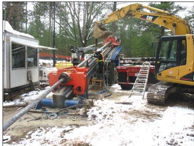
Directional Drilling rig in operation during winter conditions

The construction involved traversing a 700 metre length of property at a depth of up to 7 metres under the Wasaga Beach Provincial Park using horizontal directional drilling. Before construction, a hydraulic network analysis was completed to confirm the required internal pipe size diameter of 400-mm. The pipe used on this project was high-density polyethylene (HDPE) DR 11.