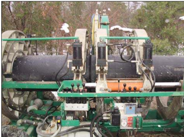
Pipe fusing rig joining two section of watermain.

Another 683 metre section of 550-mm diameter HDPE DR 9 watermain was installed from Powerline Road to the Water Pollution Control Plant (WPCP) by directional drilling. Another 150 metres of 400-mm diameter PVC DR 18 was laid from Fernbrook Drive running south on Powerline Road to intersect with the 500-mm diameter watermain. Approximately 300 metres of 400-mm diameter PVC DR 18 watermain was installed along the north side of the WPCP property. Directional drilling is also proposed to install the watermain under the Nottawasaga River, along Knox Road East to Sunnidale Road.