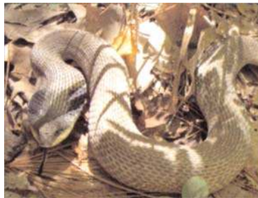
Eastern Hognose Snake

The Ainley Group initiated an Environmental Assessment under Schedule 'B' of the Municipal Class Environmental Assessment Document as issued by the Municipal Engineer's Association.