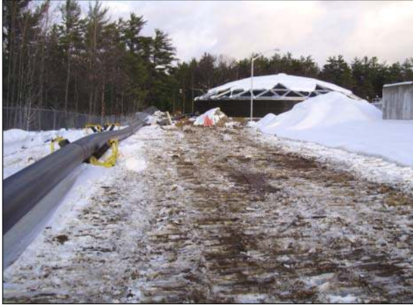
The 500-mm diameter watermain stung through the Water Pollution Control Plant, ready to be pulled under the Wasaga Beach Provincial Park property.