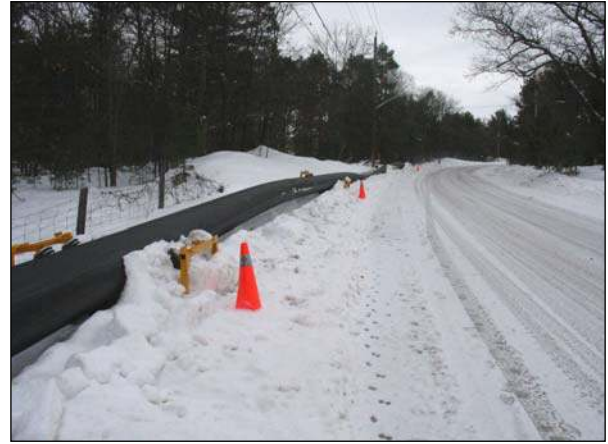
Watermain strung along Woodland Drive.

Another 683 metre section of 550-mm diameter HDPE DR 9 watermain was installed from Powerline Road to the Water Pollution Control Plant (WPCP) by directional drilling. Another 150 metres of 400-mm diameter PVC DR 18 was laid from Fernbrook Drive running south on Powerline Road to intersect with the 500-mm diameter watermain. Approximately 300 metres of 400-mm diameter PVC DR 18 watermain was installed along the north side of the WPCP property. Directional drilling is also proposed to install the watermain under the Nottawasaga River, along Knox Road East to Sunnidale Road.