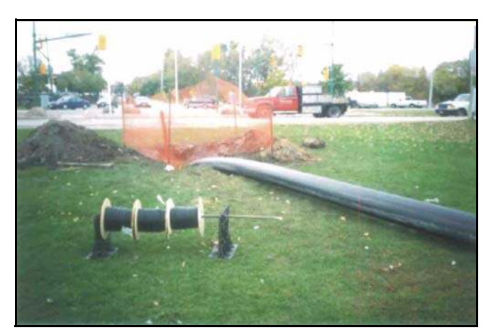
Hydrant lead beneath Lakeshore Drive.

The above helped to familiarize City staff with the benefits (and limitations) of HDD. The project was tendered in September 2002 with HDD as the primary construction method and conventional open-cut as an acceptable alternative in certain identified areas of suitable soils.