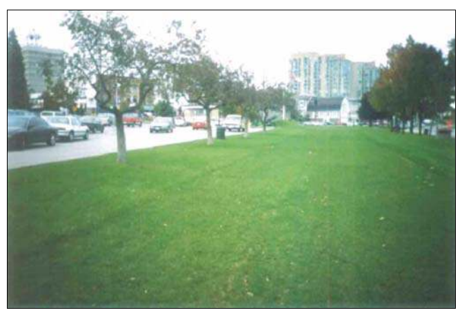
Abandoned railroad right-of-way adjacent to Lakeshore Drive.

In early 2002, the City of Barrie (Ontario) in cooperation with the Ontario Ministry of the Environment (MOE), determined that, under certain conditions, the water output (106 Lps) from Heritage Well No. 14 had insufficient chlorine contact time. To rectify the problem, the City concluded that a new 1040-metre transmission main to provide the required chlorine contact time was required, along with a 622-metre distribution watermain, complete with 6 new fire hydrants. The MOE required that the new transmission main be in service by December 31, 2002.