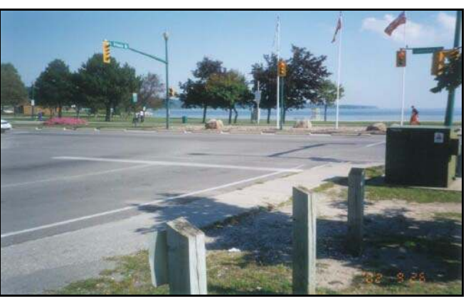
Waterfront Park at Lakeshore Drive.