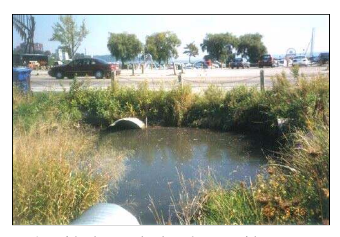
One of the three creeks along the route of the project.

The Ainley Group assisted City staff in learning more about the HDD process in general and the use of HDPE pipe by way of: