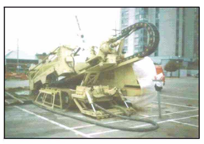
Drilling beneath Bayfield Street.

The project was awarded to Rexco Limited of Gadshill, Ontario, in mid-September 2002, at a tendered price of $1,400,000. Construction was uneventful (problem-free) and was completed on time and on budget with little disruption to the public. Archeological investigations will be undertaken within the near future to determine the origin of the corduroy road.