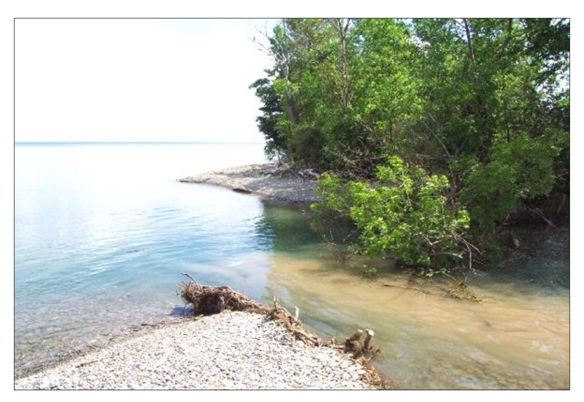
The Rattray Marsh area, shown here exiting into Lake Ontario, has been designated as an 'Environmentally Significant Area' and Provincial Area of Natural and Scientific Interest - Life Science by the Province of Ontario.

The completed Environmental Study Report, outlining the study process, alternatives and the selected preferred design, was delivered to the Region of Peel in July, 2006. The estimated capital cost of the proposed works is $18,500,000. A Notice of Study Completion was issued on April 12, 2006 and the 30 day public review period ended May 12, 2006.