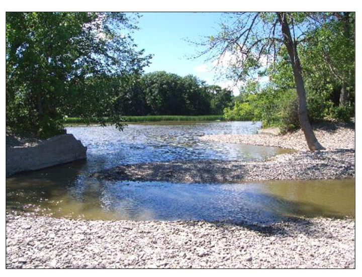
The Provincially significant Rattray Marsh borders Lake Ontario in the Bexhill Road area of Mississauga.

In 2003, the Region of Peel operations staff expressed concerns with respect to the location and condition of the existing wastewater collection system servicing the Bexhill Road area of Mississauga. Specifically, the exact location of the existing 500-mm diameter asbestos/cement forcemain crossing the Provincially significant Rattray Marsh was not known. In addition, the capacity of both the forcemain and the Bexhill Road pumping station was deemed insufficient to handle existing wastewater flows. The operations staff was also concerned that a portion of the existing 900-mm diameter trunk inlet sewer