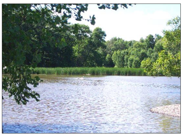
Rattray Marsh is classified as a Type 1 fishery habitat requiring a high level of protection.

Rattray Marsh is classified as a Type 1 fishery habitat requiring a high level of protection, and Sheridan Creek is classified as a Type 2 fishery habitat requiring a moderate level of protection. A total of 21 fish species are recorded for the Rattray Marsh including the Redside Dace, which is considered a threatened species by the provincial Committee on the Status of Species at Risk in Ontario (COSSARO) and a species of special concern by the national Committee on the Status of Endangered Wildlife in Canada (COSEWIC).