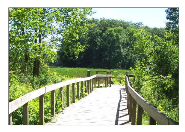
The marsh and associated parklands are used extensively by local residents and visitors throughout the summer. This usage prompted the recommendation of constructing the overall works in stages.