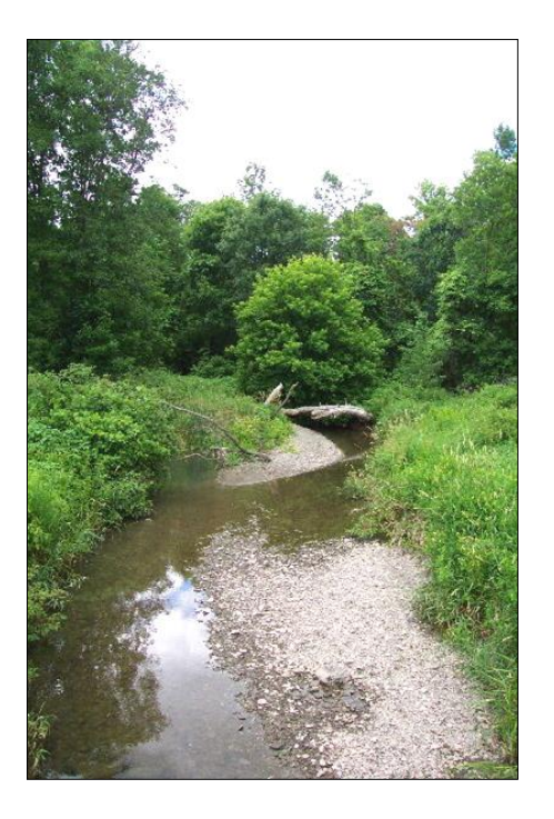
Sheridan Creek – the main source of flow into the marsh.