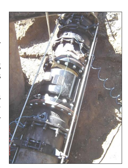
Electromagnetic flow meter positioned on the common fill/draw line

Zone 2N – retain existing venture flow meter and the existing flow signal.