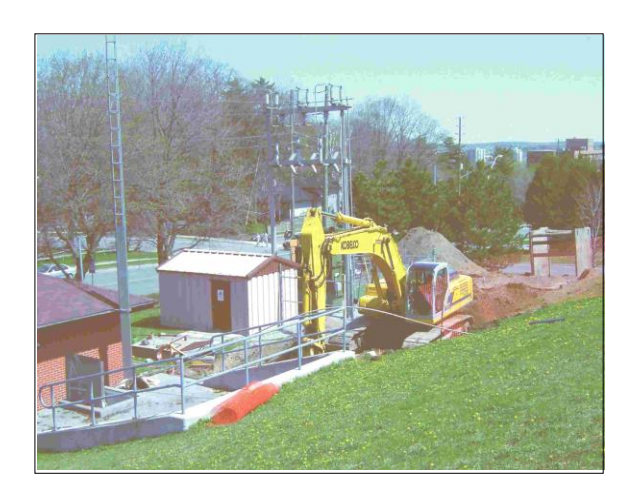
Construction at the Anne Street reservoir.

The City's existing SCADA system was expanded to include the alarms for the Anne Street reservoir's chlorination room using equipment consistent and compatible with the existing system.