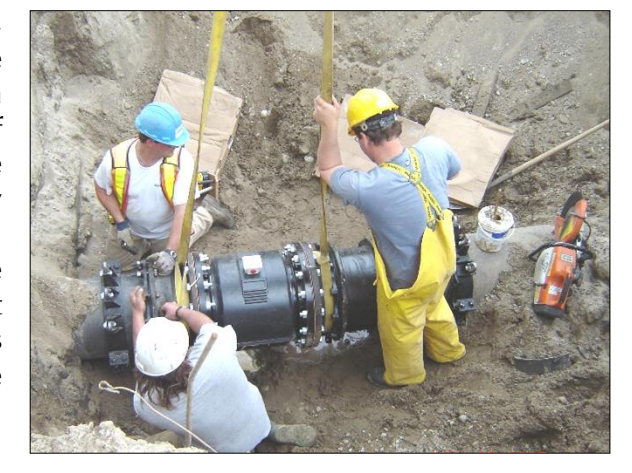
The electromagnetic flow meter being installed on the common fill/draw line.

In order to implement paced-to-flow rechlorination, a flow measurement device was required on the fill/draw line. Selection of this device was based on commonality with existing meters, ease of installation, accuracy and compatibility with the City's SCADA system and method of flow totalization. Considering these requirements, an electromagnetic flow meter was installed on the common fill/draw line by direct-bury installation at both the Mapleview and Bayfield site. The meters were located with at least 2 metres (5 pipe diameters) of straight pipe before and after.