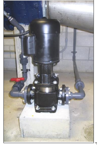
The chlorine booster pump at the Bayfield reservoir showing the water draw and injector piping.