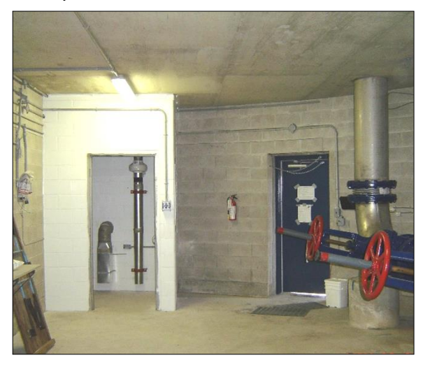
Completed chlorine room inside the valve room at the Mapleview Elevated Tank Reservoir.

The room, sized to accommodate the chlorination components, gas sensor and HVAC equipment, also has a viewing window, unit heater with thermostat, passive ventilation through a brick vent ducted to the floor, an eyewash station and a shower supplied with process water through a dedicated 12-mm line and a manually activated emergency exhaust fan.