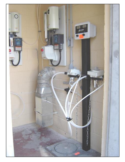
Inside the chlorine room at the Anne Street reservoir showing the chlorinators, weigh scales, vent and gas sensors.

The room, sized to accommodate the chlorination components, gas sensor and HVAC equipment, also has a viewing window from the pump room, a convection style wall heater with thermostat, passive ventilation through a brick vent ducted to the floor and a manually activated emergency exhaust fan. The emergency eye-wash station is mounted on the outside wall of the chlorine room. Construction involved standard non-bearing block walls extending to the ceiling, which were then filled with compressible material to seal the rooms. Existing masonry brick and block was cut for the installation of permanent lintels for the exterior door and all vents and exhaust fans.