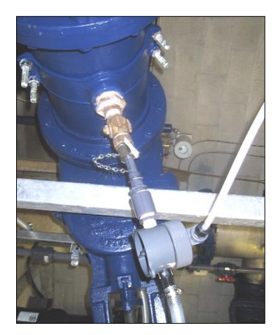
The injector and injection point installation at the Mapleview reservoir.

A 19-mm fixed-throat chlorine injector with an initial rechlorination capacity of 4.5 kg/day (10 lbs/day) was selected; since this size covers the majority of the operating volumes. It was recommended that the injector be provided with sufficient capacity to draw up to 9 kg/day (20 lbs/day) in the event that higher rechlorination rates are needed in the future. The injector is a close-coupled stop style, adjacent to the point of application, which keeps the length of the chlorinated water injection pipe to a minimum.