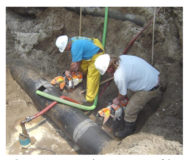
Construction personnel cutting a section of the common fill/draw line to provide a space for the flow meter at the Mapleview Elevated Tank.

Ontario Regulation 170/03 outlines requirements regarding the sampling, reporting, the minimum level of treatment for surface and groundwater supplies and the maintenance of a chlorine residual within the distribution systems. In compliance with the regulation, the work at the City's reservoirs is being implemented to ensure the chlorine residual levels that are currently meeting the minimum requirements are maintained.