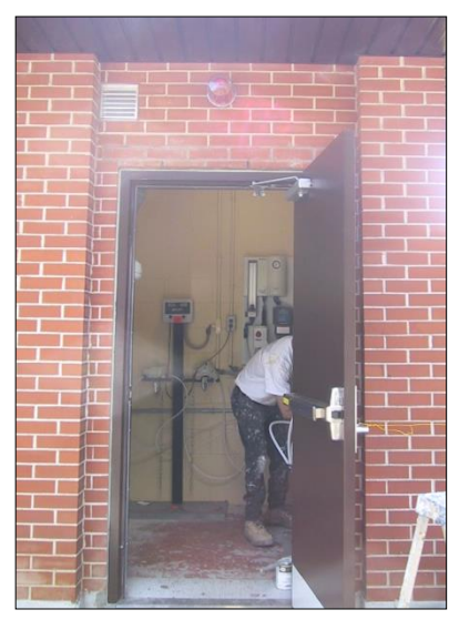
The dedicated access door to the chlorine room. The emergency strobe light and exhaust vent can be seen above the door frame.