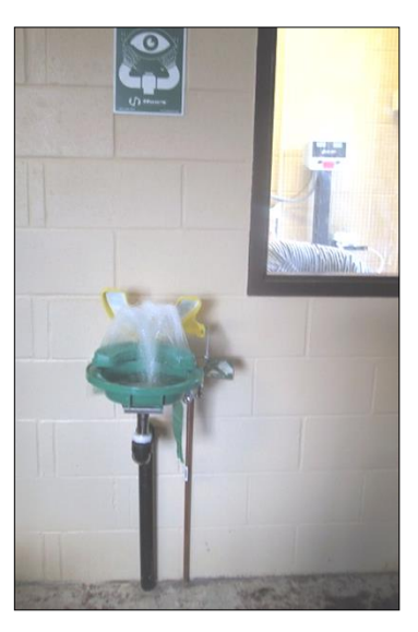
The emergency eye-wash station on the outside wall of the chlorine room.