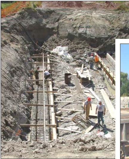
Preparing the footings for the bridge after excavation.