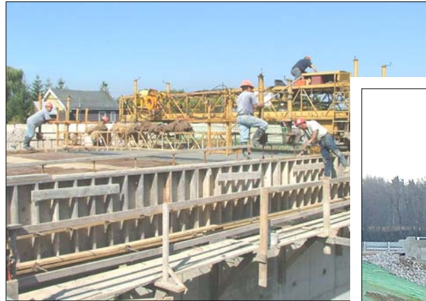
Pouring and finishing the deck after completion of the superstructure.