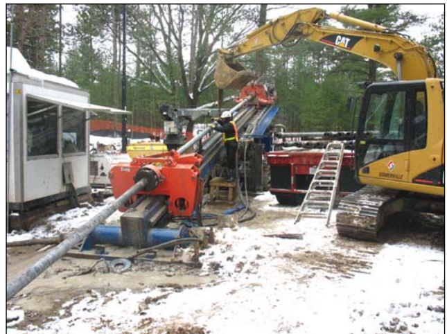
Directional Drilling rig in operation during winter conditions

The construction involved traversing a 700 metre length of property at a depth of up to 7 metres under the Wasaga Beach Provincial Park using horizontal directional drilling. Before construction, a hydraulic network analysis was completed to confirm the required internal pipe size diameter of 400-mm. The pipe used on this project was high-density polyethylene (HDPE) DR 11.