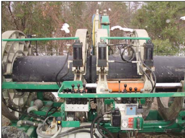
Pipe fusing rig joining two section of watermain.

Another 683 metre section of 550-mm diameter HDPE DR 9 watermain was installed from Powerline Road to the Water Pollution Control Plant (WPCP) by directional drilling. Another 150 metres of 400-mm diameter PVC DR 18 was laid from Fernbrook Drive running south on Powerline Road to intersect with the 500-mm diameter watermain. Approximately 300 metres of 400-mm diameter PVC DR 18 watermain was installed along the north side of the WPCP property. Directional drilling is also proposed to install the watermain under the Nottawasaga River, along Knox Road East to Sunnidale Road.