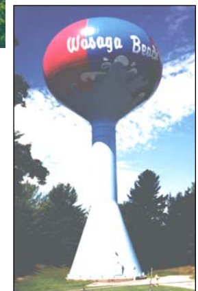
East End Reservoir

The Ainley Group met with The Town of Wasaga Beach and the Ministry of Natural Resources (MNR) at the site location to discuss construction options. In the past, the Town had requested approval from the MNR for the installation of a watermain through the Provincial Park area using open cut construction. The open cut method was discounted because the Ministry was concerned about possible damage to the natural environment. At a meeting held on a later date, horizontal directional drilling construction methods for pipe installation were discussed with and accepted by the MNR.