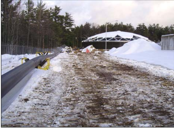
The 500-mm diameter watermain stung through the Water Pollution Control Plant, ready to be pulled under the Wasaga Beach Provincial Park property.