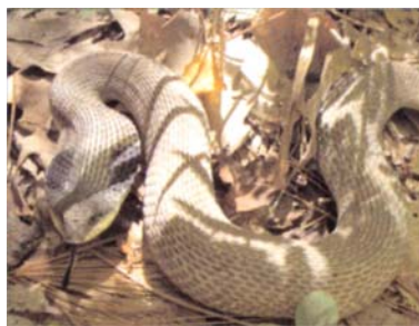
Eastern Hognose Snake

The Ainley Group initiated an Environmental Assessment under Schedule 'B' of the Municipal Class Environmental Assessment Document as issued by the Municipal Engineer's Association.