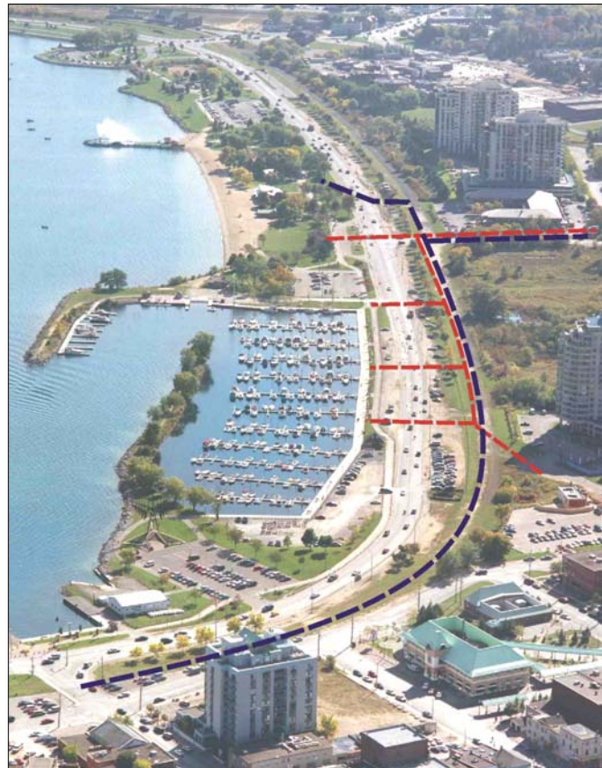
Barrie's waterfront showing Lakeshore Blvd, the abandoned railway right-of-way and the location of the project. The purple dashed line indicates the transmission main and the red dashed line shows the transmission main location.

This was the first major project undertaken by the City of Barrie using trenchless technology. It not only resulted in a considerable saving when compared to conventional open-cut methods, it also minimized the disruption normally associated with the installation of buried services. The project, awarded to Rexco Limited of Gadshill, Ontario, at its tendered price of $1,400,000, was completed with little disruption to the public, on time and on budget.