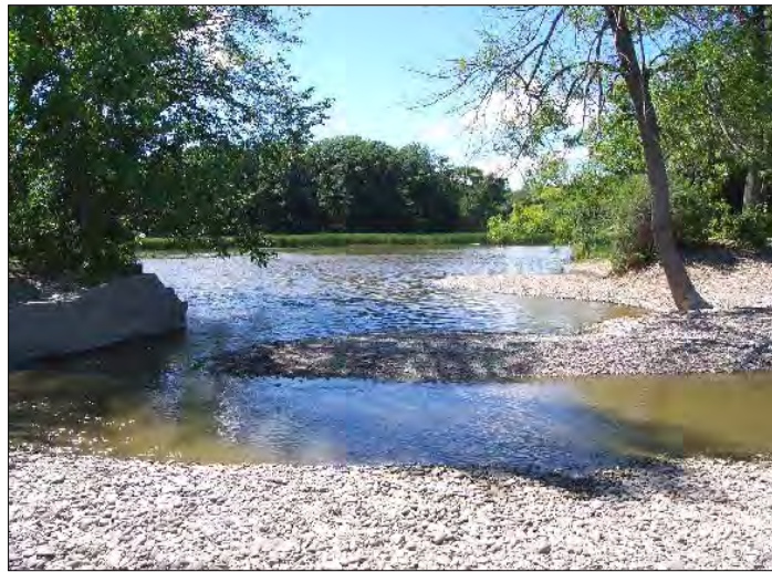
The Provincially significant Rattray Marsh borders Lake Ontario in the Bexhill Road area of Mississauga.

In 2003, the Region of Peel operations staff expressed concerns with respect to the location and condition of the existing wastewater collection system servicing the Bexhill Road area of Mississauga. Specifically, the exact location of the existing 500-mm diameter asbestos/cement forcemain crossing the Provincially significant Rattray Marsh was not known. In addition, the capacity of both the forcemain and the Bexhill Road pumping station was deemed insufficient to handle existing wastewater flows.